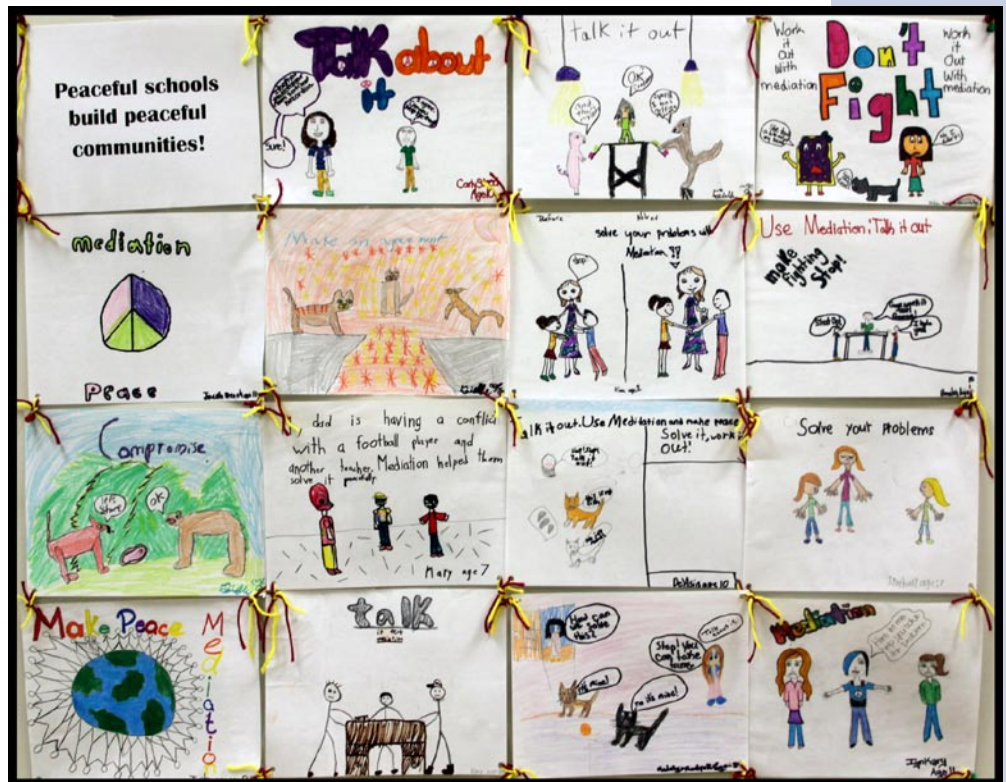
Fifteen elementary students who are studying conflict resolution skills in the Florida State University Schools, Second Circuit, were inspired to create this colorful, peace-promoting “quilt.”