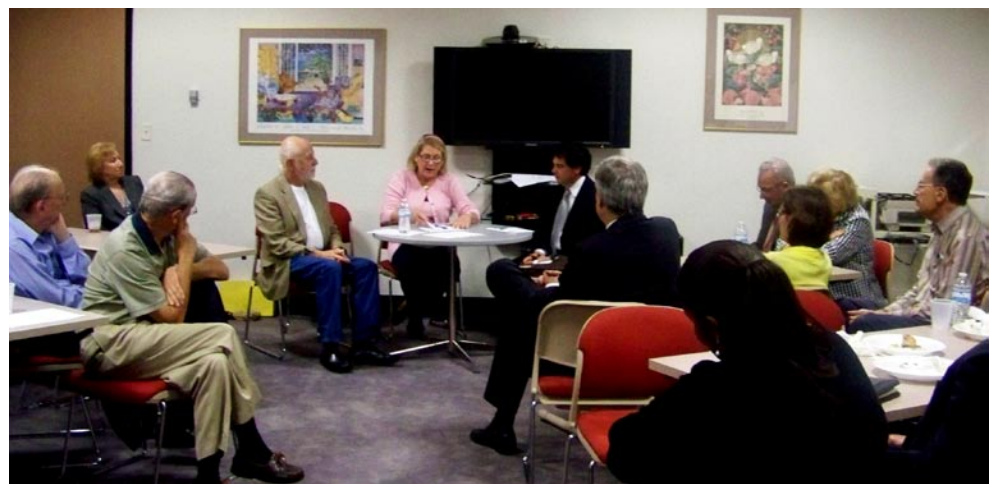
A volunteer mediator conducts a mock mediation for the benefit of judges and mediators attending the Fifteenth Circuit's Mediation Week training activity.

In the Twelfth Circuit, mediators received Mediation Week proclamations from the Sarasota and Manatee Boards of County Commissioners. And inside and outside the Sarasota, Bradenton, and Venice courthouses, mediators displayed banners and signs to draw attention to Mediation Week. In addition, the circuit hosted a continuing mediator education session on diversity and domestic violence issues as well as an outreach landlord/tenant presentation. Meanwhile, throughout the week, various web